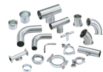
The quality and surface finish of the Tri-Clover BioPharm products are determined to match the exact requirements of the industry.

A machined square-cut method is used to provide properly finished end facings, ensuring the most accurate, consistent orbital welds. All fittings are inspected visually, while ovality and squareness tolerances are inspected with calibrated equipment. All surface finishes are inspected with a calibrated profilometer to measure the Roughness average (Ra).