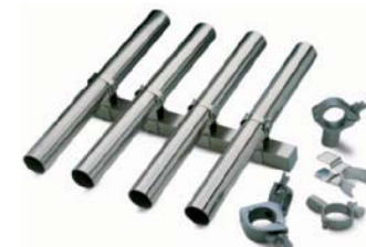
Whatever your sanitary application, Alfa Laval is able to supply the right tube.

The tubes are produced in compliance with the DIN 11866, ASME BPE, ISO 2037 and BS 4825, with extremely high demands on materials, hygiene and manufacturing accuracy.