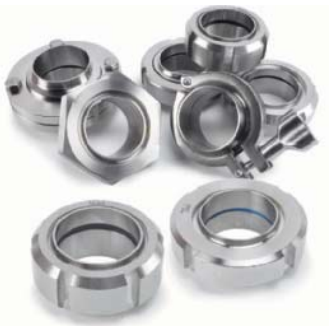
Unions are available in a number of standards, including SMS, ISO, BS, IDF, DS, DIN and clamps.

Flanges and clamp fittings are suitable for flexible and easy maintenance. Flanges and clamp fittings with finger nuts are especially suited for processes where the load on seals is extra high, where easy control and replacement of seals is necessary and where optimal cleaning is required.